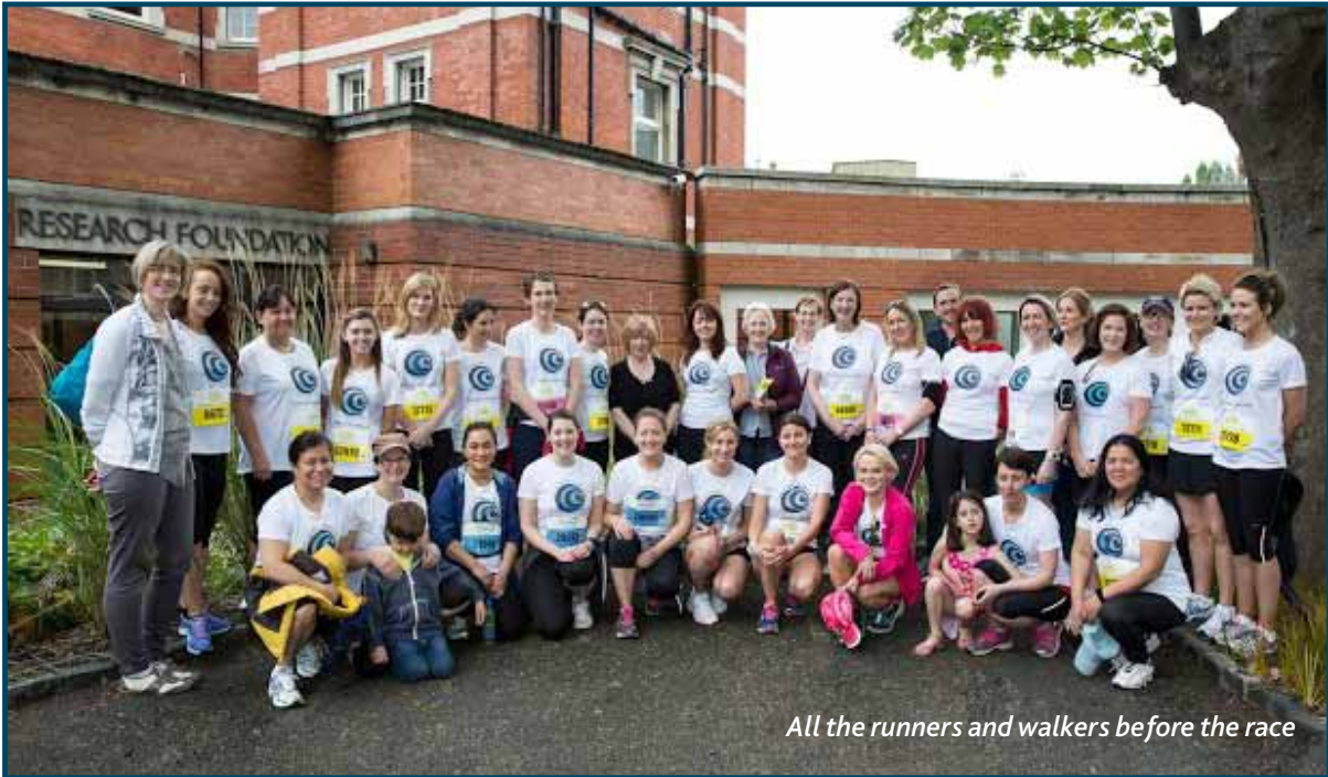
All the runners and walkers before the race