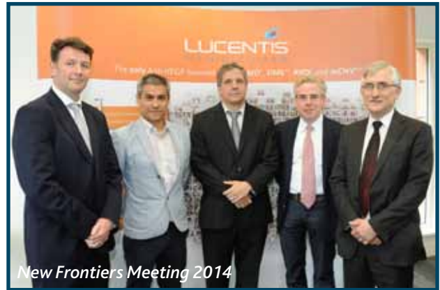
New Frontiers Meeting 2014